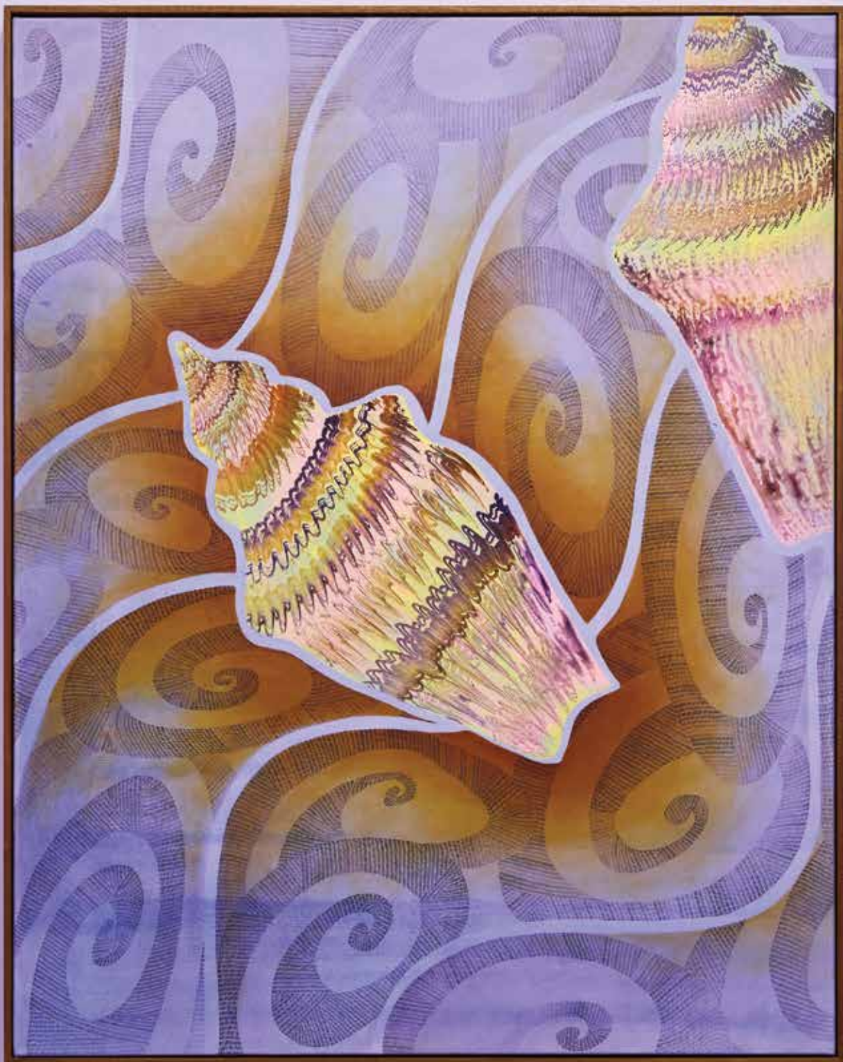
Jade Townsend, Sisters at Takapuna Beach , Acrylic on linen, 2023