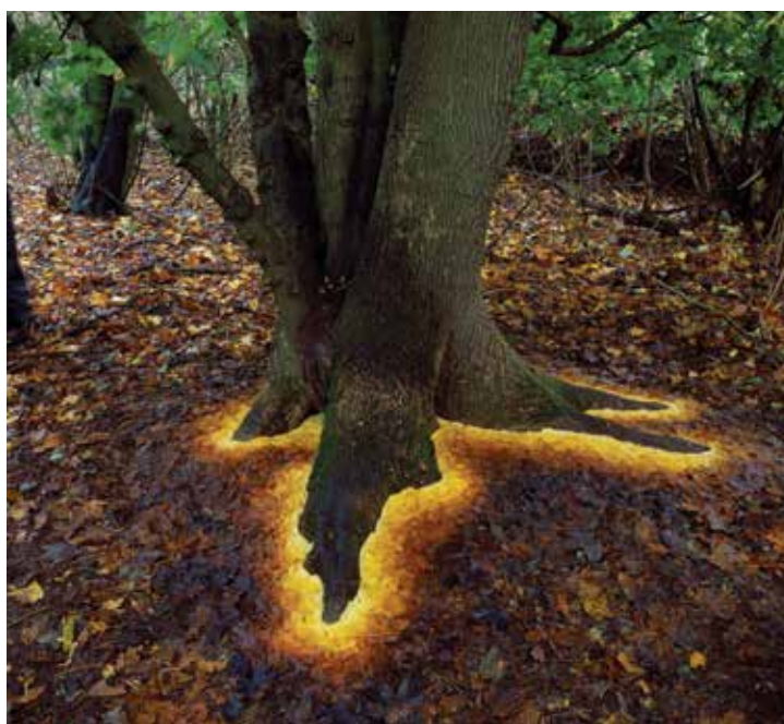
Andy Goldsworthy, Glowing Tree , 2013

In one of our most popular programmes, ākonga will explore our relationship with the natural world and learn more about how organic material can be used to create eco-friendly artworks. Using natural materials ākonga will create their own artwork inspired by nature. They will gain a deeper understanding and connection to Papatūānuku through exploring the work of artists who use natural materials in their practice. This is also an opportunity for ākonga discuss the complexity of the relationship between humans and their environment, as well as ways to ensure we take better care of the planet in the future.